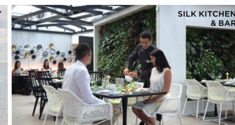
SILK KITCHEN & BAR