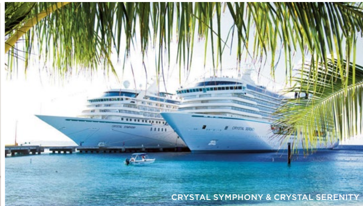
CRYSTAL SYMPHONY & CRYSTAL SERENITY